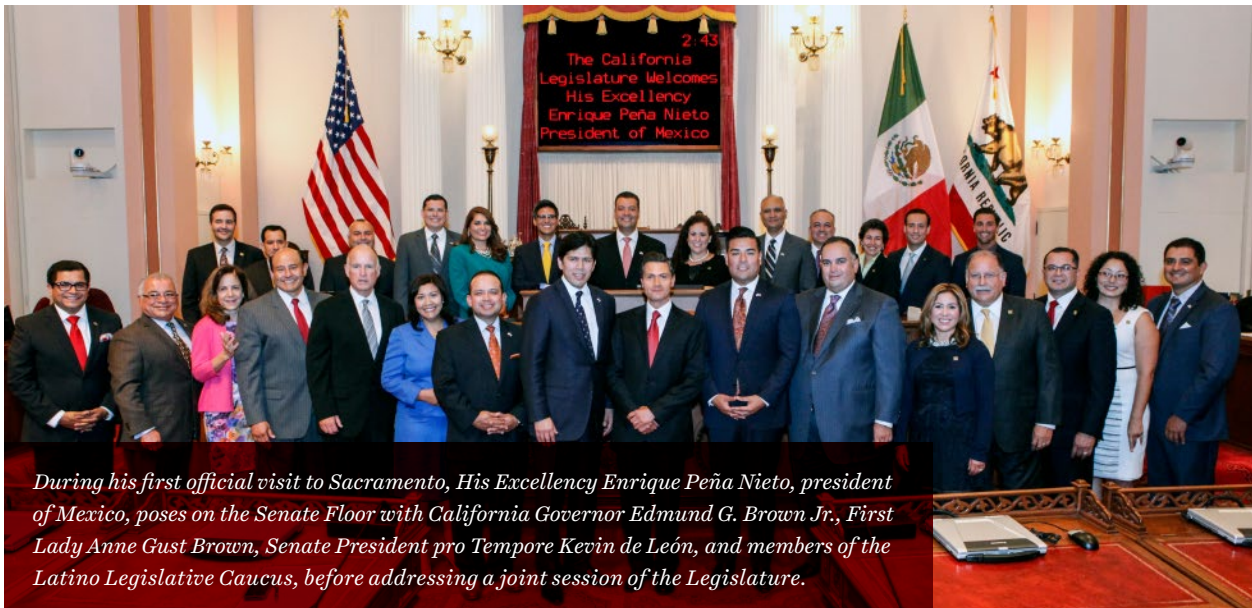
During his first official visit to Sacramento, His Excellency Enrique Peña Nieto, president of Mexico, poses on the Senate Floor with California Governor Edmund G. Brown Jr., First Lady Anne Gust Brown, Senate President pro Tempore Kevin de León, and members of the Latino Legislative Caucus, before addressing a joint session of the Legislature.

The Foundation established the CALIFORNIA MEXICO EXCHANGE PROGRAM to increase cross-border dialogue and cooperation with California's largest trading partner. These efforts include legislative exchanges, conferences and other out-reach projects.