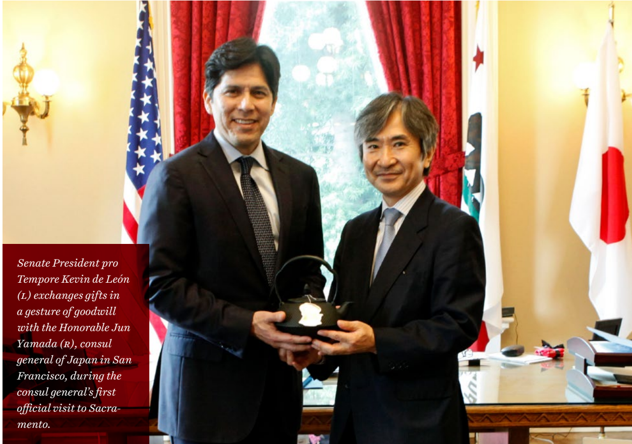
Senate President pro Tempore Kevin de León (L) exchanges gifts in a gesture of goodwill with the Honorable Jun Yamada (R), consul general of Japan in San Francisco, during the consul general's first official visit to Sacramento.