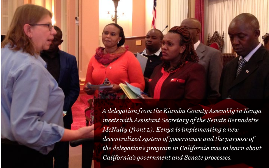
A delegation from the Kiambu County Assembly in Kenya meets with Assistant Secretary of the Senate Bernadette McNulty (front L). Kenya is implementing a new decentralized system of governance and the purpose of the delegation's program in California was to learn about California's government and Senate processes.

Among its many activities, the Foundation facilitates bringing foreign delegations to California in an effort to promote democratic principles and institutions, share information and technology, as well as to enhance California's competitive position in the global marketplace.